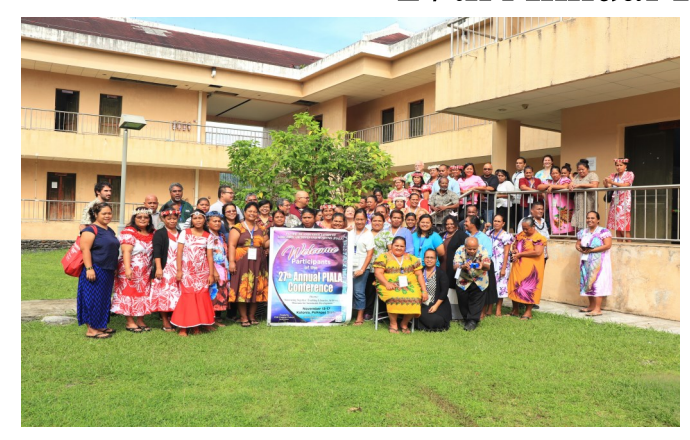
Participants Group Photo

The 27th Annual PIALA Conference was held in Kolonia, Pohnpei from November 13-17, 2017 with a theme: Innovating together, enabling libraries, archives and museums for sustainable development.