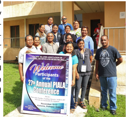
Palau Participants Group Photo

connect and learn so much but this variety of cultures so different from one another were together learning to paddle one boat to travel the horizon in search of ways to thrive and be successful.