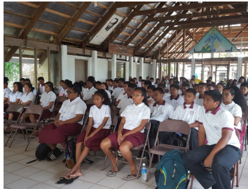
Mindszenty High School Students from grades 9-12