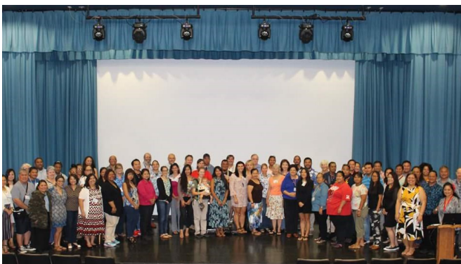
Participants Group Photo

The Guam Preservation Trust (GPT) hosted the inaugural Pacific Preservation Summit with the theme "Connect, Appreciate, Preserve" from February 26-28, 2018. This summit brought together preservation agencies, professionals, students, and the general public to Guam to share best practices and challenges dealing with preservation in their counties. The summit was funded by the Department