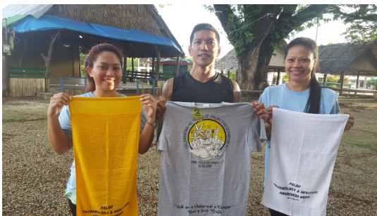
Participants of the walk/run with their prize

The Bureau of Cultural and Historical Preservation (BCHP) celebrated its 3rd Annual Palau Archaeology and Heritage Awareness Week on May 18-22, 2018 as per President Declaration No. 15-154.