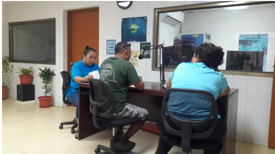
Radio Talk Show at Eco-Paradise FM