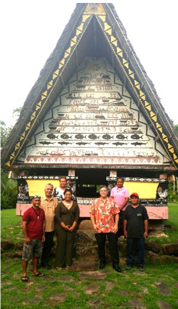
At Bai er a Rengarairrai

As partner of the U.S. National Park Service Historic Preservation Program and as a courtesy the Palau Bureau of Cultural and Historical Preservation organized a historical and cultural tour for the U.S. Assistance Secretary of the Interior for Insular and International Affairs Mr. Doug Domenech on his first official visit to Palau where he conferred with President Tommy Remengesau, Jr. on the Compact of Free Association.