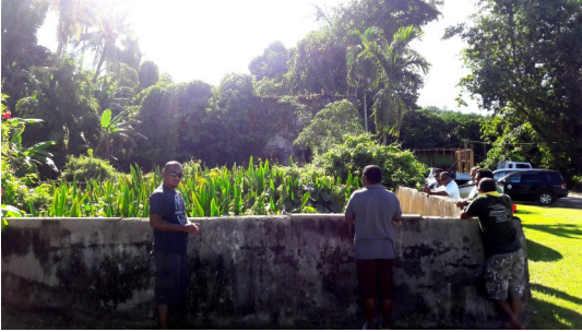
Site Cleaning at Japanese Water Pump, Koror