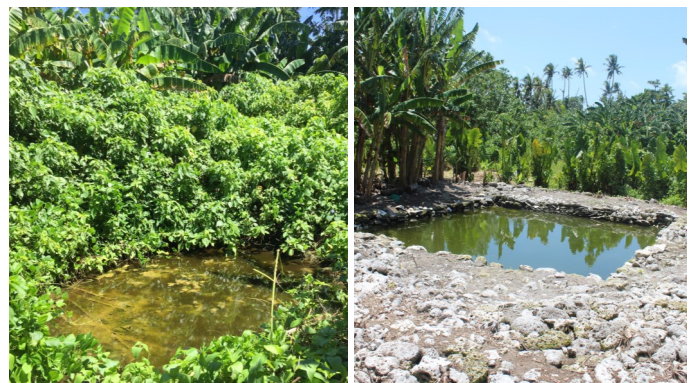
Before Photo of Diong er a Dokou After Photo of Diong er a Dokou

The site rehabilitation grant is awarded annually to one state in order to enhance the protection and preservation of Palau’s registered heritage sites.